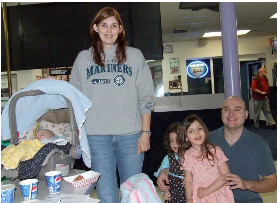
Enjoying Family Fun Night at the bowling alley.